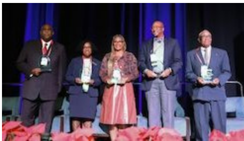
2025 All-State School Board

AASB recognized recipients of its highest honor, the All-State School Board Member Award Dec. 5 during the annual convention awards luncheon.