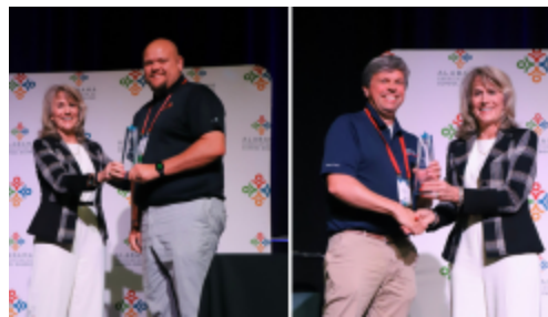
2025 Advocacy A-Team

The award recognizes up to five of Alabama's most outstanding past or present school board members. Learn more.