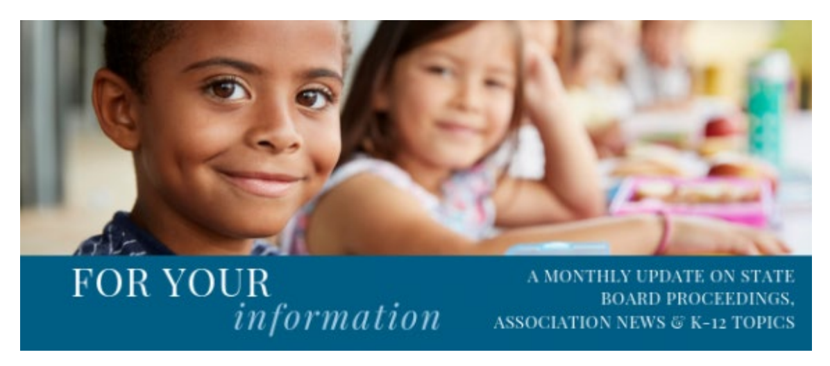
August 9, 2019